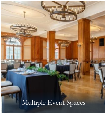
Multiple Event Spaces

At the only true full-service indoor wedding venue of its kind in the region, let our professional team at Hotel Saranac help make your special day both breathtaking and a breeze.